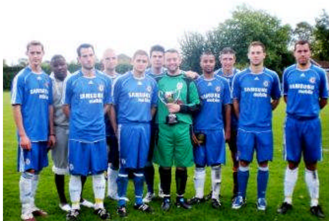
The victorious Battersea Old Boys team. Yet again!